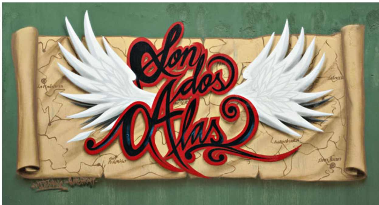
Son Dos Alas cover. Painting/design by Woset-Wan.

hop's linguistic, physical, visual, and auditory codes. Although the native language of hip-hop is English, rappers today in Kenya have dominated the flow in Swahili, dancers in Japan have turned break dance into an acrobatic phenomenon, graffiti artists in South Africa have developed a complex graphic design used from mural walls to skin, and disc jockeys in Germany have turned the record player into a musical instrument with its own form of musical notation.