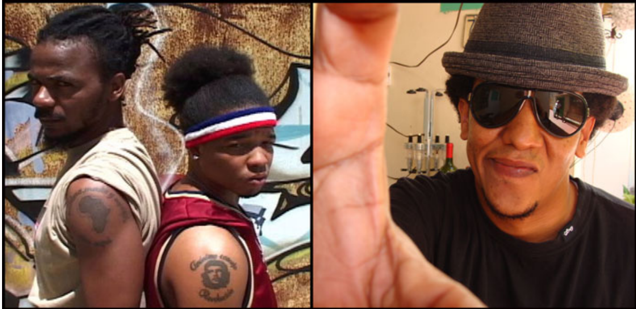
Left: Anónimo Consejo in Alamar filming "La ley 5566" music video. Right: Tego Calderón interview with author in 009Once home recording studio, San Juan Puerto Rico.